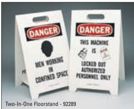
Two-In-One Floorstand - 92289