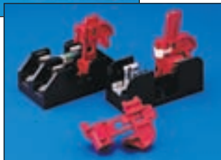
Fuse Lockout Device

Unique locking mechanism prevents device from being accidentally removed from fuse block. Blockout devices can be used to blockout 6mm to 17mm and blade fuse types. Patent # 5,207,590, #4,669,794.