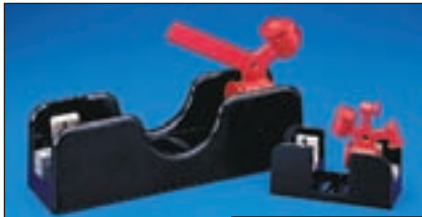
Fuse Blockout Device