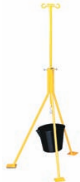
Lead Hook Stand (bucket not included)