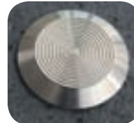
Stainless Steel Non-Spigot