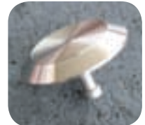
Stainless Steel Spigot